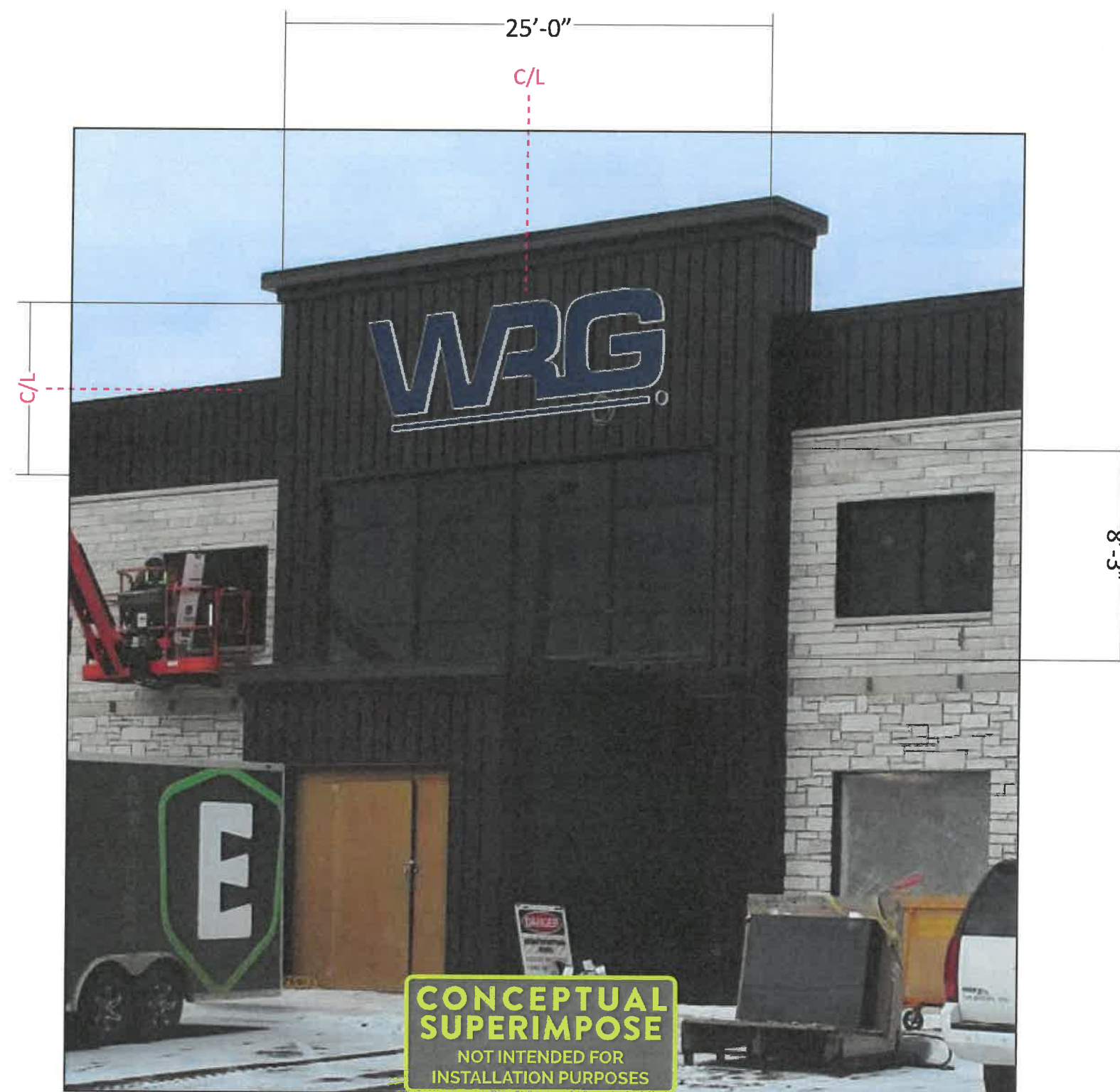
ART SUPERIMPOSED ON PHOTO - DAY VIEW